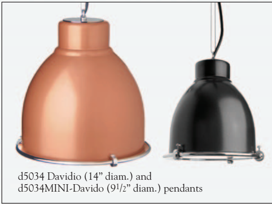
d5034 Davidio (14" diam.) and d5034MINI-Davidio (9 1/2" diam.) pendants