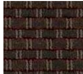
959 Campfire 18-0510 TPX, 18-1018 TPX