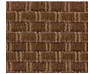
828 Lodge 15-1215 TPX