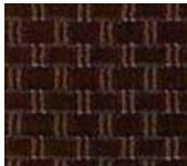
878 Explore 18-0928 TPX, 18-5203 TPX