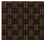
686 Evergreen 19-0618 TPX, 17-1312 TPX