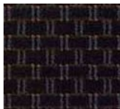
555 Night Sky 18-0201 TPX, 17-1506 TPX