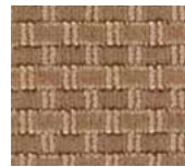
772 Rustic 16-1407 TPX, 17-1312 TPX