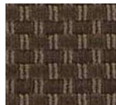
646 Spruce 17-0610 TPX, 18-0510 TPX