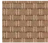
727 Cross Country 15-1306 TPX, 16-1324 TPX