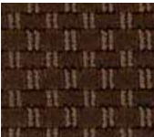
858 Wilderness 18-0617 TPX, 17-1327 TPX