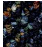
507 DEEP LAGOON