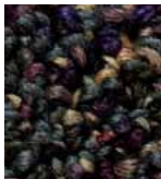
425 DEEP ORCHID