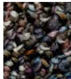
211 SMOKEY SAGE