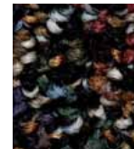
407 JUNIPER BERRY