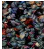
231 NAPA GREEN