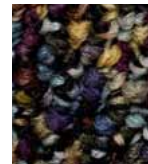
405 EMPEROR'S PURPLE