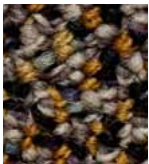
416 TUT'S TREASURE