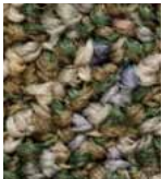
101 GARDEN GREEN

Style Number ..... DL453 Style Name ..... Attribute Modular Construction ..... tufted Surface Texture ..... level loop graphic Gauge ..... 1/10" (39.4/10 cm) Density..... 6,963 Weight Density..... 167,112 Sustainable Content ... Contains a minimum 35% pre-consumer recycled content by total weight Stitches Per Inch ..... 10.6 (41.73 per 10 cm) Protective Treatment... DuraTech Finished Pile Thickness .123 (3.12 mm) Dye Method ..... yarn dyed Backing Material ..... EcoFlex ICT Face Yarn ..... Duracolor® Premium Fiber with Antron® Legacy Fiber Technology ..... Duracolor® by LEES Stain Resistant System. Passes GSA requirements for permanent stain resistant carpet. Face Weight ..... 26.0 oz/yd2 (881.66 g/m2) Size/Width ..... 24" x 24" (60.9 cm x 60.9 cm) Installation Method.... monolithic IAQ Green Label Plus . 1098 CRI Rating ..... Severe Traffic Pattern Repeat ..... Not Applicable Warranties ..... Lifetime Limited Modular Warranty, Lifetime Duracolor Stain Warranty, Lifetime Static