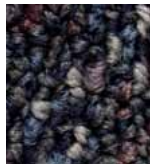
208 CLIFF GREY