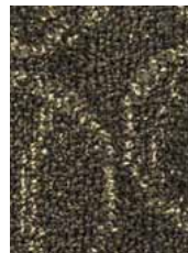
6119 Wicked 17-0517TPX, 19-0515TPX