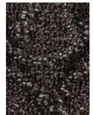
7025 Mega 18-0403TPX, 19-4007TPX