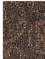
7111 Accidental 18-1016TPX, 19-1015TPX