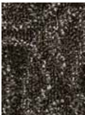
1288 Exotic 18-5203TPX, 19-0515TPX