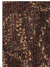
7099 Hot 18-1016TPX, 19-1420TPX