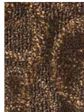
7109 Delicious 18-1016TPX, 19-1015TPX