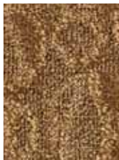
1291 Organic 16-1010TPX, 18-1016TPX