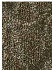
1378 Brilliant 18-5203TPX, 19-0515TPX