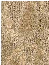
7087 Pseudo 15-1225TPX, 17-1019TPX