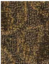
7081 Lucky 17-1019TPX, 18-0403TPX