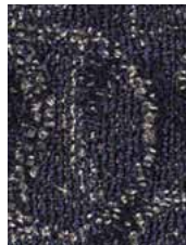
7093 Rich 18-0403TPX, 19-4025TPX