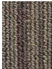
00410 Slate Concerto