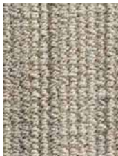
00409 Grey Treble