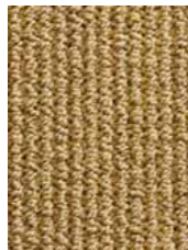
00402 Golden Horn