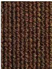
00408 Brown Adagio