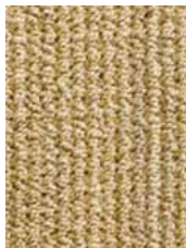
00401 Flax Interlude