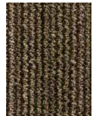
00407 Mocha Staccato