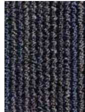
00413 Navy Intermezzo