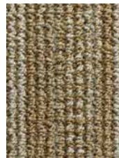
00404 Olive Overture