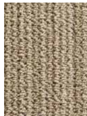
00403 Graphite Tempo