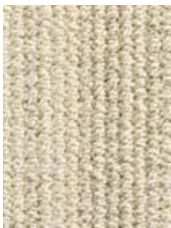
00400 Beige Harmony