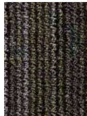
00411 Cobalt Allegro