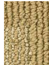
826 Savanna 17-1022 TPX