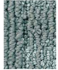
929 Moran 17-0207 TPX