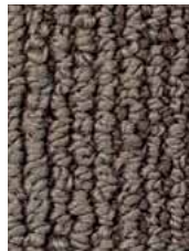
824 Nairobi 19-0812 TPX