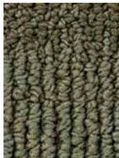
688 Iringa Region 18-0515 TPX