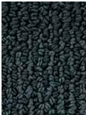
981 Ancient Rituals 19-4015 TPX