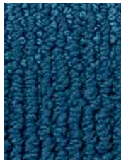
554 Mzee 19-3919 TPX