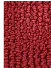
372 Tribal Robe 19-1334 TPX