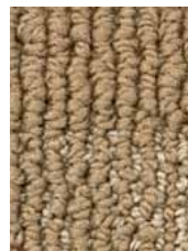
748 Kraal 17-1118 TPX