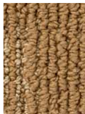
851 Kenya 18-0937 TPX