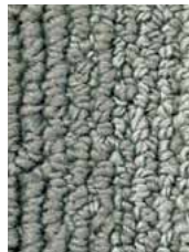
945 Irkipirat 15-6304 TPX