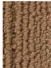
868 Ngama Hills