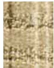
726 Palm Grove