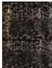
599 Midnight Meeting