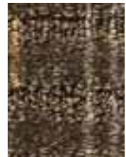
889 Tangler Market