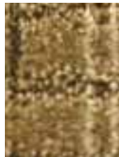
856 Tan Tan