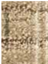
729 Camel Trek