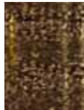
881 Casbah Fortress