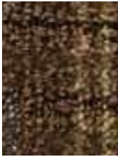
895 Dark Terrain