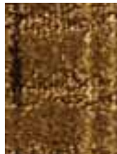
852 Desert Stone