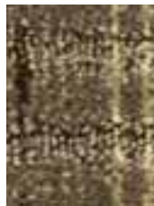
649 Hidden Oasis