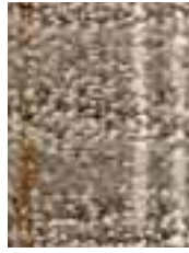
938 High Plateau