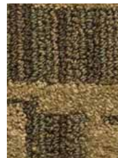
84407 Nice Tan