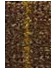
881 Casbah Fortress