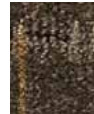
889 Tangler Market