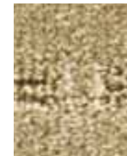
726 Palm Grove