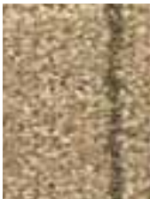
729 Camel Trek