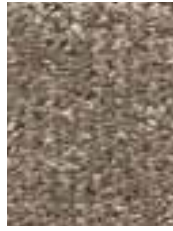
938 High Plateau