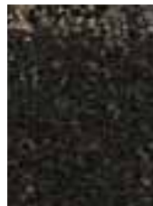
599 Midnight Meeting