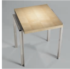
The legs step back from the front and back of the Option A Exotic Wood table surface

Classic and simple in form, Horizon end and coffee tables were inspired by the open terrain of the Southwest. As in the natural environment, details emerge with observation. Tops of natural materials are compatible with the needs and aesthetics of a variety of spaces and juxtapose with the sleek angled metal legs. The character and details of the Horizon tables are also found in Horizon lounge seating.