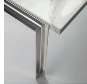
The tables are designed to be viewed from all angles, side front, and back