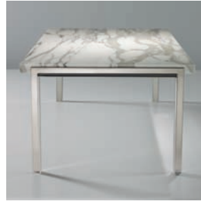
The angled legs create a shadow line while keeping the profile clean and contemporary