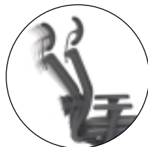
Phased two-step back release mechanism