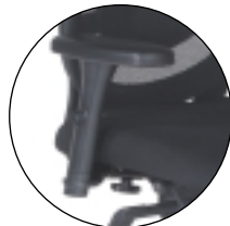
Height and width adjustable arms*