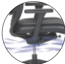
Floating synchro mechanism