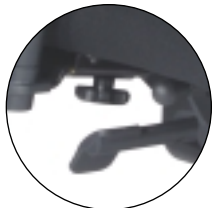
Side knob tension adjustment