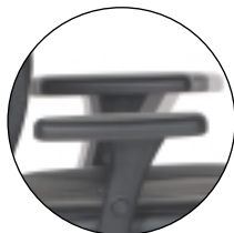
Adjustable arm pads*