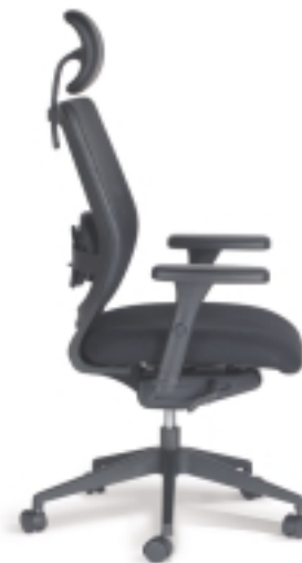
9889VM AQUA II MESH FABRIC