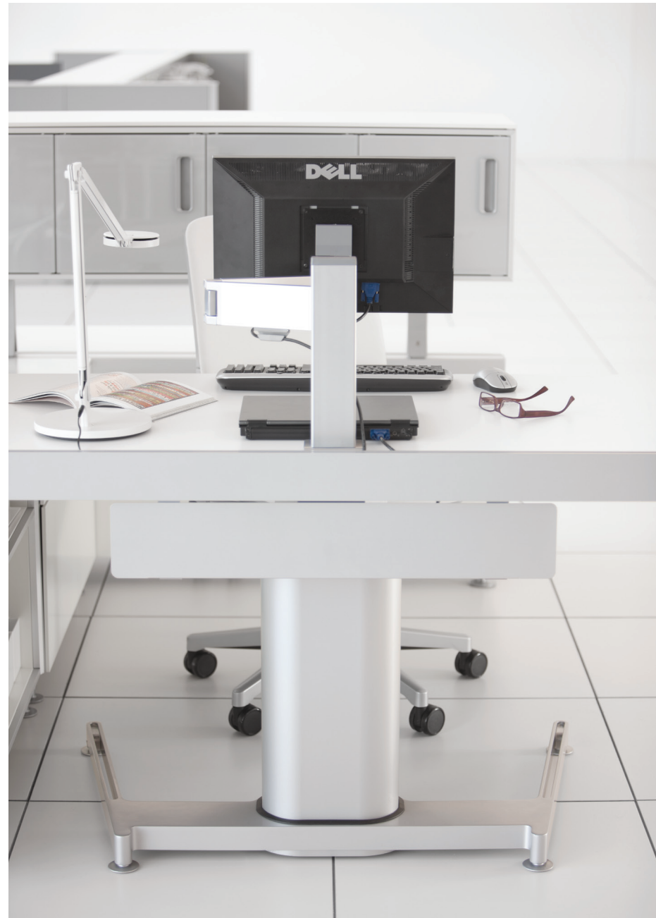
Airtouch worksurfaces can be individualized with a variety of products ranging from modesty panels to SOTO™ worktools and cableways to Eyesite™ monitor arms.

Like all Details products, Airtouch was designed with the well-being of the individual in mind by supporting their physical, cognitive and social needs. So in addition to height-adjustability, Airtouch can be personalized with an assortment of Details and Steelcase products that make work (and life) easier and more comfortable—benefiting the individual and leading to a happier, healthier and of course, more productive workplace.