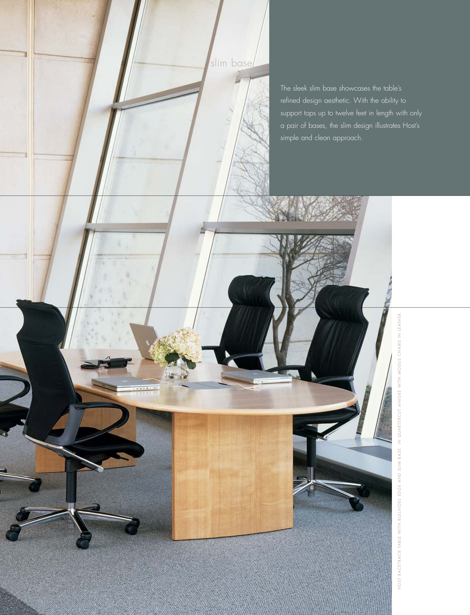
HOST RACETRACK TABLE WITH BULLNOSE EDGE AND SLIM BASE IN QUARTERCUT ANIGRE WITH MODIUS CHAIRS IN LEATHER.

The sleek slim base showcases the table's refined design aesthetic. With the ability to support tops up to twelve feet in length with only a pair of bases, the slim design illustrates Host's simple and clean approach.