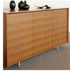
✓ Buffet height credenza with wood doors in quartercut walnut