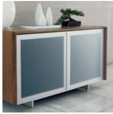
✓ Standard height credenza with glass doors in quartercut walnut