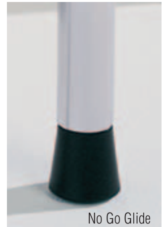
No Go Glide