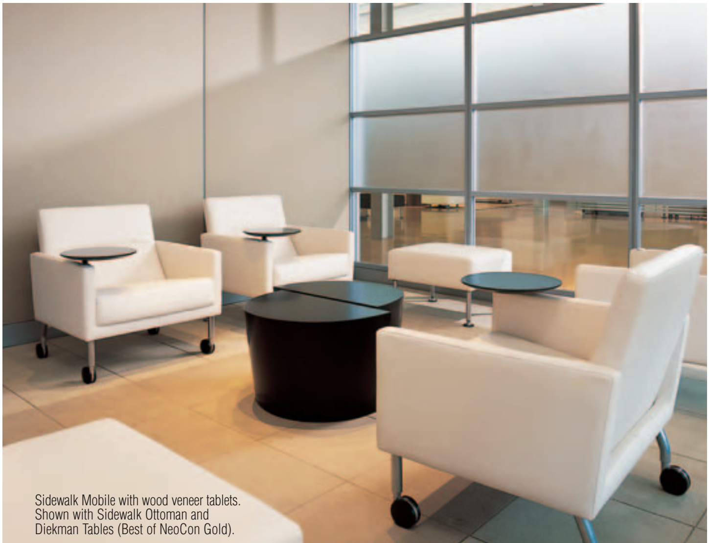
Sidewalk Mobile with wood veneer tablets. Shown with Sidewalk Ottoman and Diekman Tables (Best of NeoCon Gold).