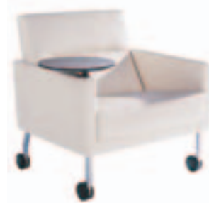
446M Highback Mobile Optional Wood Tablet