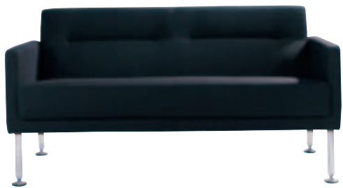
444-2 Lounge Two Seat Sofa