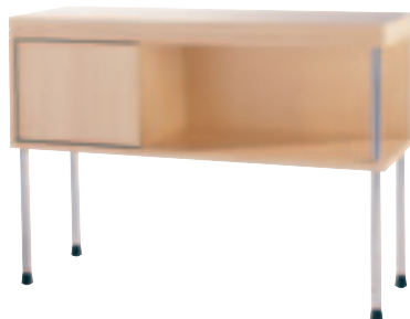
43-S174833 High Credenza