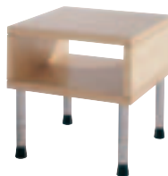
43-ST171717 Storage Table