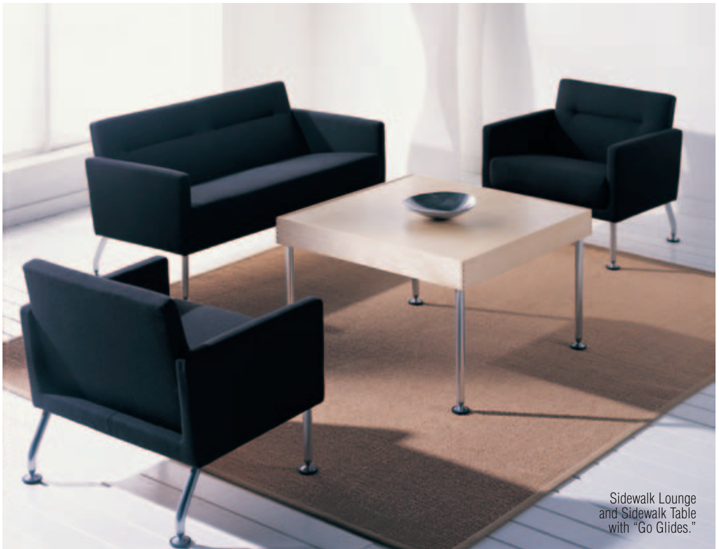
Sidewalk Lounge and Sidewalk Table with "Go Glides."