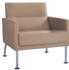
446 Lounge Highback Chair