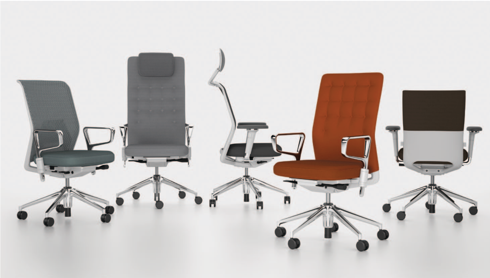
Starting with the main models, the right ID Chair can be configured to meet the customer’s needs and wishes

Antonio Citterio is an architect and designer who lives and works in Milan. He has been working with Vitra since 1985, during which time he has helped to design a number of popular office chairs and office systems. The Citterio collection is expanding continuously, including the addition of products for the Vitra Home Collection.