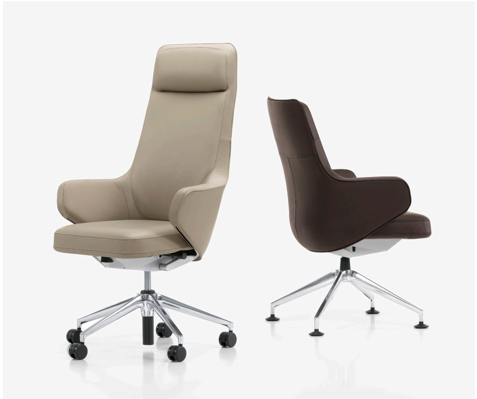
The backrest of the Skape 'hugs' the person sitting in it and lends a feeling of security.

Skape's decorative seams allow individual pieces of leather to be smoothly and evenly sewn together, thus achieving a perfect fit on the luxurious, zoned padding of the seat and backrest. The decorative seams also highlight the details of the seat, thus creating an independent design.