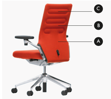
The innovative technology for healthy comfort is hidden within the elegant backrest.