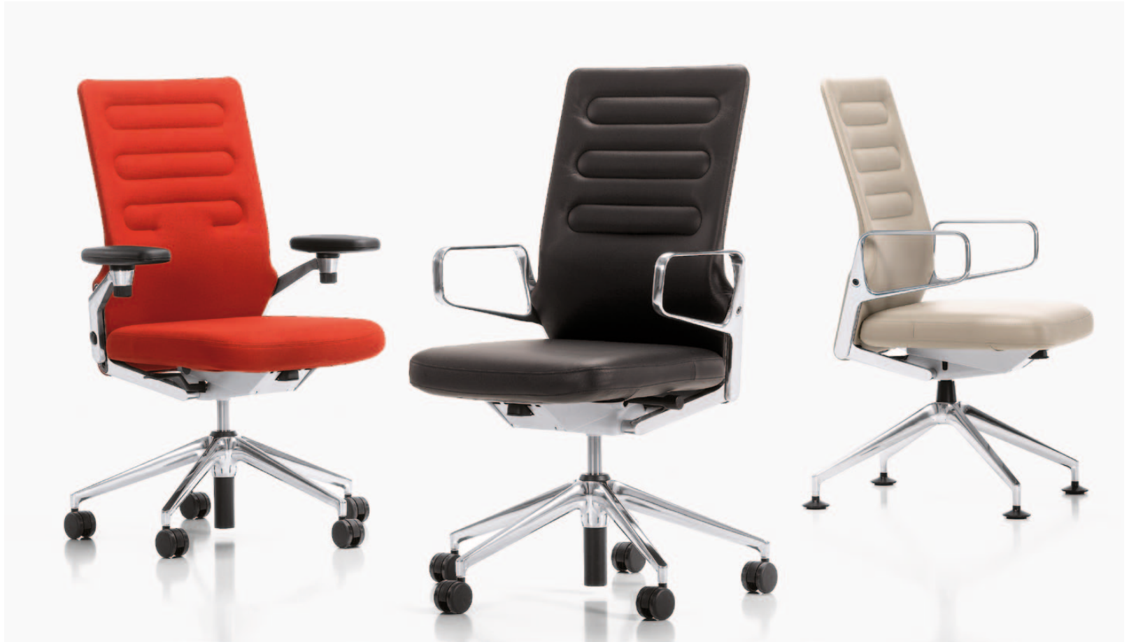
The AC 4 is available in various models to match the required purpose – its four-star base is ideal for conferences.

When designing the AC 4, the aim was to subtly integrate the functions required to provide the best level of comfort. The reason for this is that until now, office chairs were either designed with a view to aesthetics or to functional characteristics. The AC 4, by contrast, integrates its ergonomic properties in such a subtle way that the constructional tricks are hidden away. The AC 4 creates a balance between advanced ergonomic functionality and subtle design. The innovative technology is neither showy nor hidden under foam padding. This makes the AC 4 an iconic object with an aura of elegance coupled with uncompromising functionality.