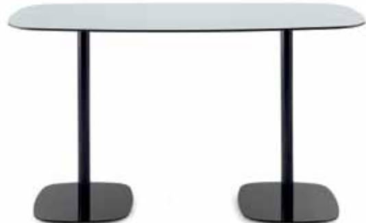
LOTTUS TWO-POST LEG TABLE COEL423072