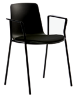
LOTTUS LOOP ARM UPHOLSTERED INSERT COEL300UPH