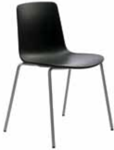
LOTTUS ARMLESS POLY SHELL COEL100

Enea Lottus tables are offered in occasional, standard, bar, and café heights and assorted widths.