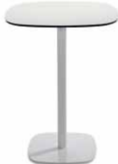
LOTTUS CAFÉ HEIGHT TABLE COEL4230