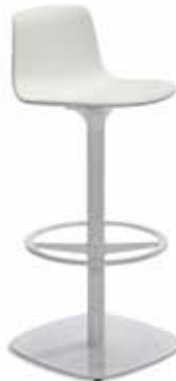
LOTTUS POST STOOL COEL700INSERT