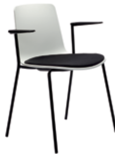
LOTTUS CANTILEVER ARM UPHOLSTERED INSERT COEL200UPH