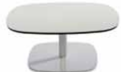
LOTTUS OCCASIONAL HEIGHT TABLE COEL1830