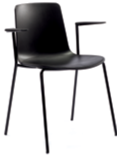
LOTTUS CANTILEVER ARM NON-UPHOLSTERED WITH POLY INSERT COEL200INSERT