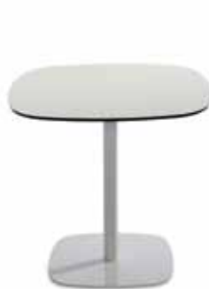
LOTTUS STANDARD HEIGHT TABLE COEL3630