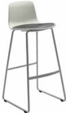
LOTTUS SLED STOOL COEL400INSERT