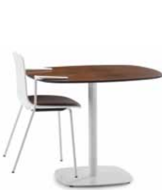
LOTTUS CANTILEVER ARMCHAIR COEL400INSERT