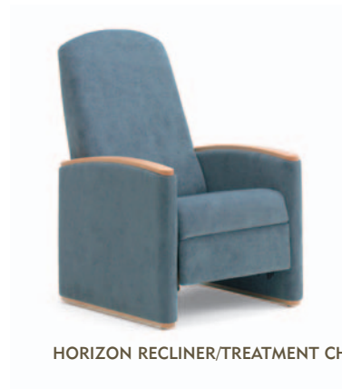
HORIZON RECLINER/TREATMENT CHAIR: 731