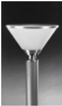
PARMA Pole Mounted Luminaire

Simple lines and a classic shape make PARMA suitable for a wide variety of architectural designs. The high-grade aluminum housing and reflector shade are satin anodized. The translucent matte acrylic lens provides diffused illumination. Inverted tapered, or straight round steel pole with flush handhole is hot-dip galvanized prior to being finished in