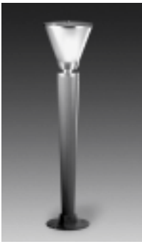
PARMA Illuminating Bollard

The precision-machined housing and reflector shade of high-grade aluminum are satin anodized. The translucent matte acrylic lens provides diffused illumination. Inverted tapered bollard shaft of cast aluminum is finished in finely textured paint. Bollard is secured to ground mounting assembly with stainless steel socket head cap screws. All hardware is stainless