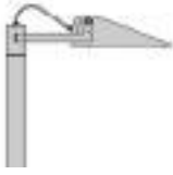
Pole Mounted Luminaires NOVARA SXL