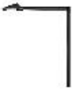
Pole Mounted Luminaires NOVARA SAL