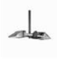
Pendant Luminaires NOVARA ML