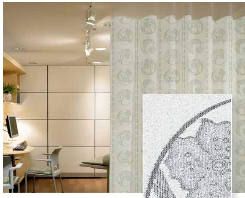
Fabric shown full scale

There may be variation in color, texture and finish between the sample shown and the actual product. Cover image shown with selvage.