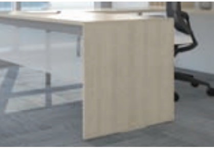
Worksurfaces may be supported by full End Panels in addition to Steel Legs or Pedestals.