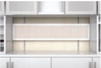
A magnetic Tackboard spans between vertical components to display notes, photos and art.