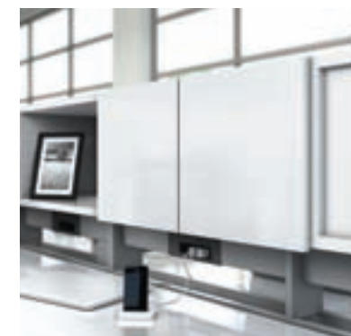
Modular components install in a snap – they just slide and lock into place. Overhead Cabinets are offered with or without frosted glass or laminate doors, or as an open pass-through.