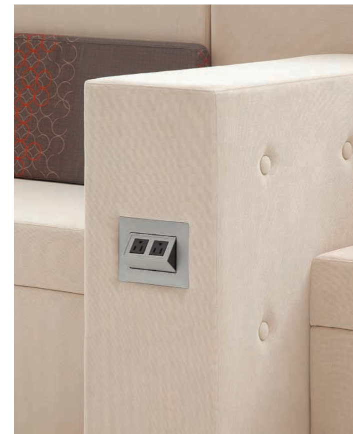
Multiple electrical port options positioned to power up with ease.