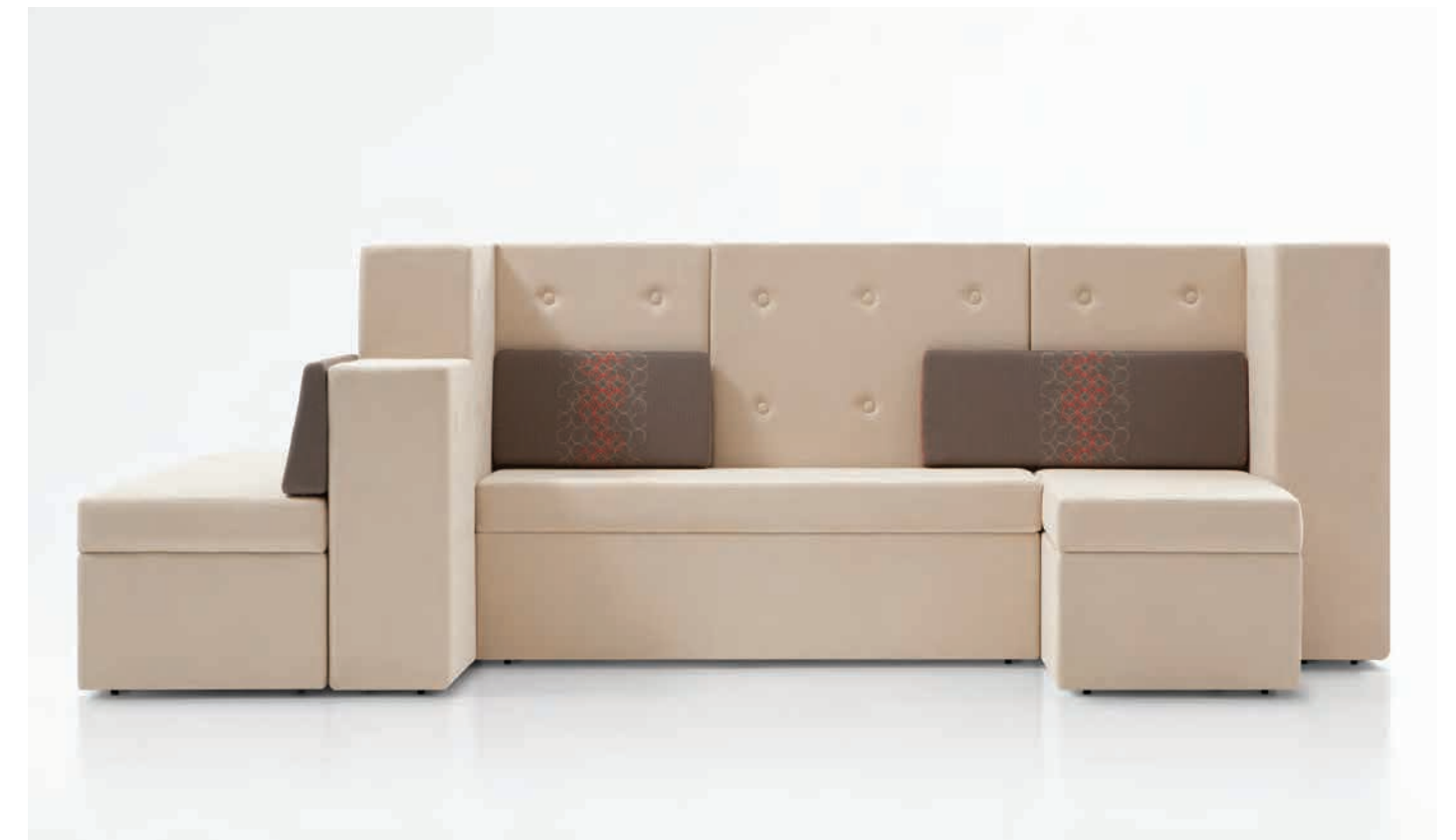
A simple composition of ottomans and backs, Tangent operates like a refined system, snapping easily together or apart through a series of plugs disguised as upholstery buttons. Two wall height options available for varying levels of privacy.