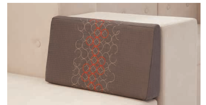
22" and 33" cushion options allow for additional comfort or just to add a pop of color.