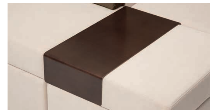
Overlay tables provide hard surfaces for beverages or writing without taking up additional floor space.