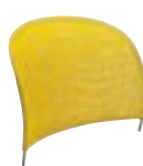
Yellow NCS S0585-Y20R