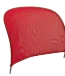
Red NCS S1580-R