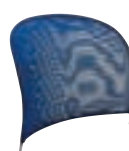
Blue NCS S5540-R70B