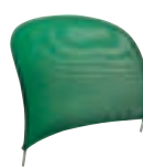
Green NCS S3060-G