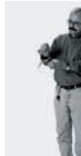
Design 1997. Christoph Hindermann

«My objective is to use optimal technology to create thoroughly convincing constellations with a minimum in materials.»