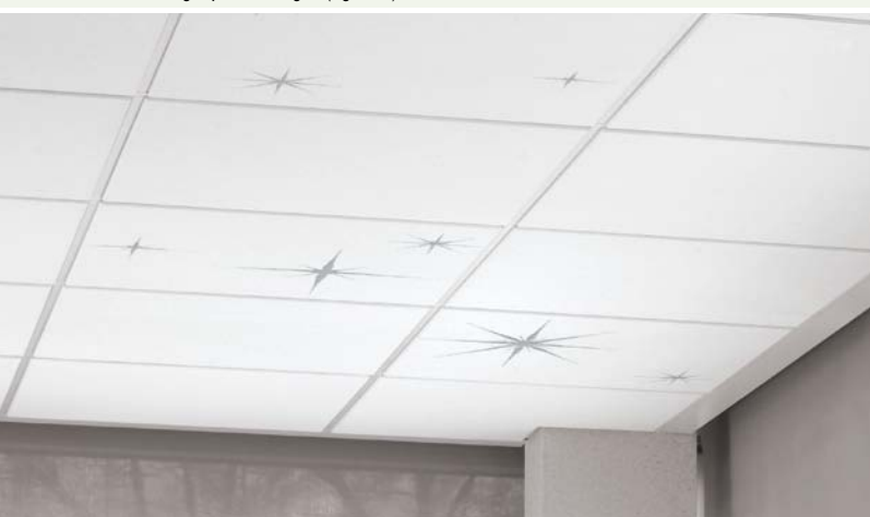
Ultima Themes Stars 2' x 2' with Prelude 15/16" Exposed Tee grid (Pg. 215)