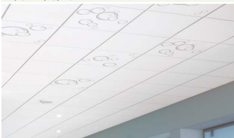
Ultima Themes Bubbles 2' x 2' on Silhouette 9/16" grid (Pg. 217)