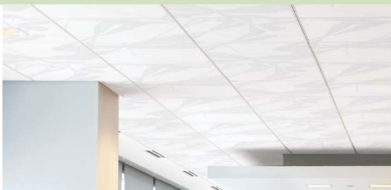
Ultima Themes Dragonflies 2' x 2' with Silhouette® 9/16" grid, 4-panel and single panel designs (Pg. 217)