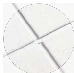
Ultima Themes Beveled Tegular with Suprafine® 9/16" Exposed Tee grid