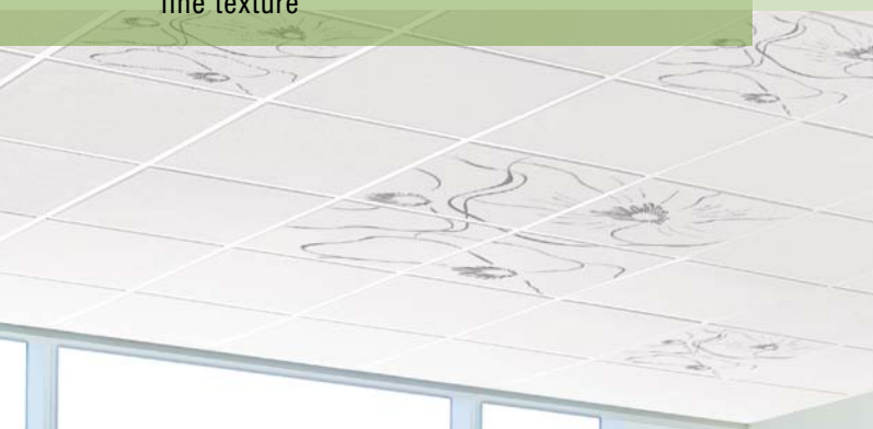
Ultima Themes Blooms 2' x 2' with Prelude® 15/16" Exposed Tee grid, 4-panel and single panel designs (Pg. 215)