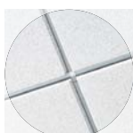
Ultima Themes Vector with Prelude 15/16" Exposed Tee grid