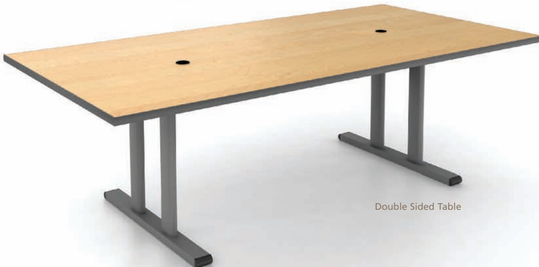
Double Sided Table