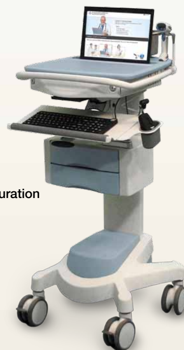
Flex Laptop Configuration