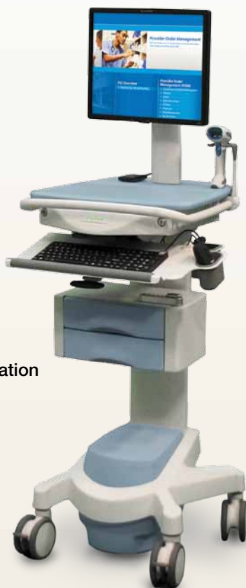
Flex CPU Configuration