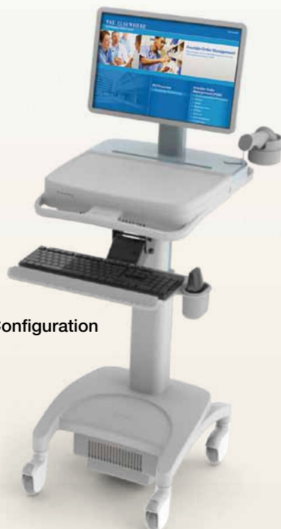
Standard CPU Configuration

Plus, the advanced technology of the ST7 LiFe Battery also provides superior cell protection, eliminates the safety risks of high temperature issues associated with other batteries and offers superior battery management software to protect data and boost productivity.