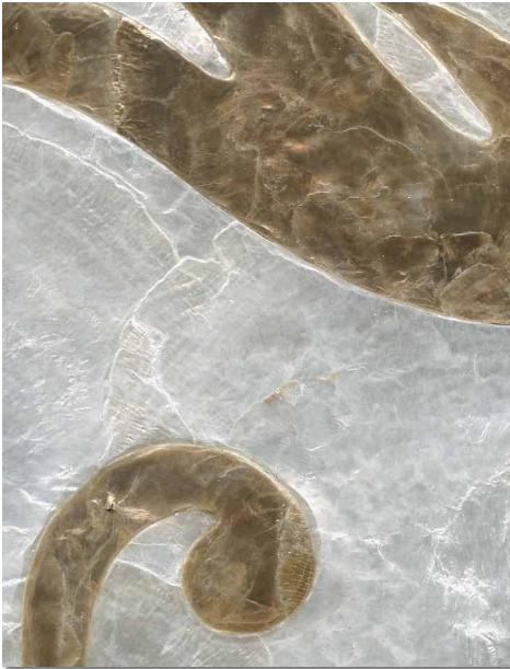
MR-MAM-0102 Natural Pearl