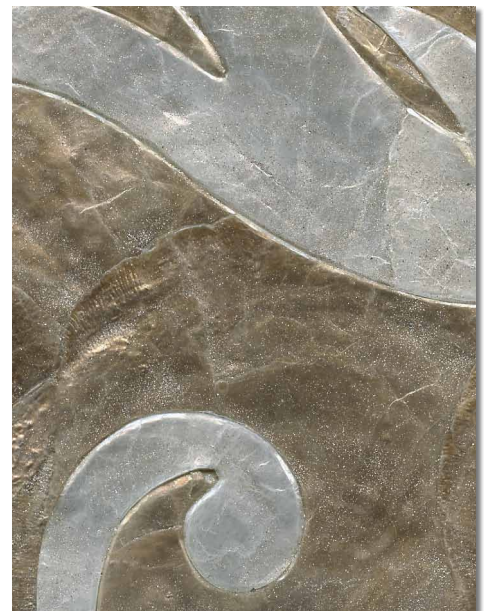
MR-MAM-0210 Platinum Pearl