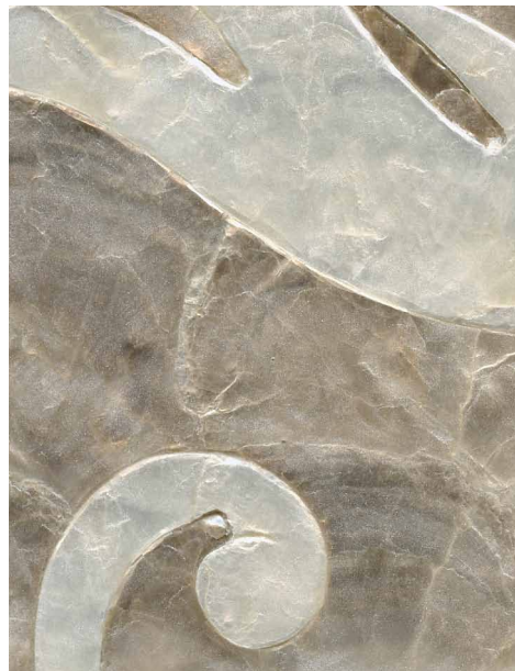
MR-MAM-0211 Gold Taupe