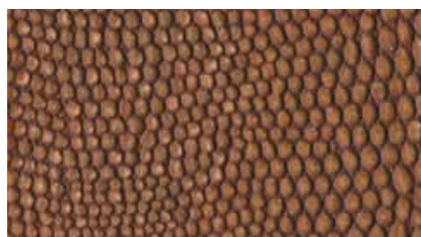
MR-RV-73244 Rambling Red