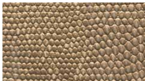
MR-RV-73X10 Shimming Sand