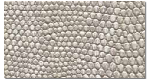
MR-RV-72176 Secret Silver