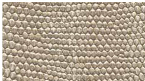
MR-RV-72464 Stealthy Taupe