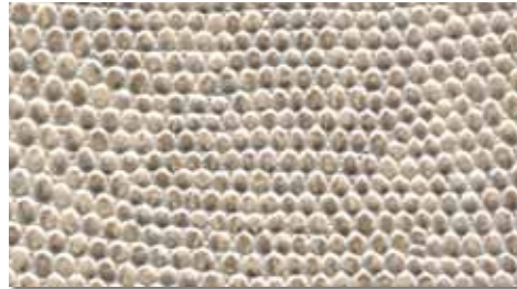
MR-RV-73175 Sneaky Silver