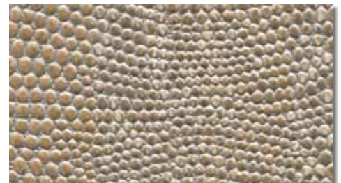
MR-RV-73055 Prowling Platinum