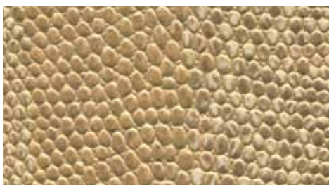
MR-RV-73169 Gliding Gold