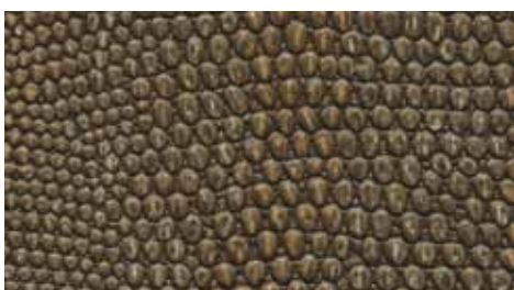
MR-RV-73105 Sauntering Bronze