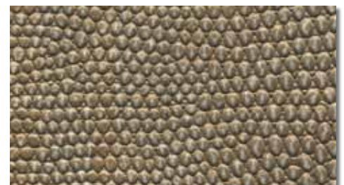
MR-RV-73667 Serpentine Multi