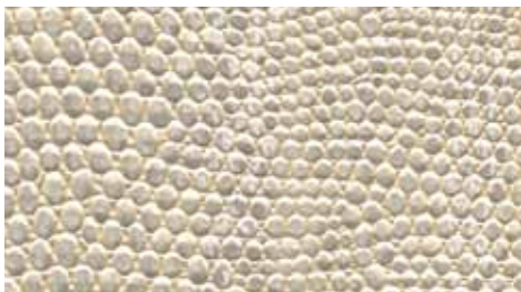
MR-RV-72X14 Twisting Tawny