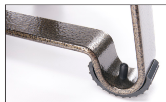
Molded Foot Gripper