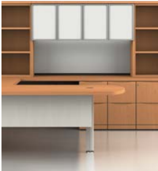
LEFT Overhead with wood doors, conference desk with wood column leg, half height painted modesty panel CENTER Bookcase and overhead with wood doors, rectangular desk with rectangular metal leg, half height wood modesty panel RIGHT Overhead with frosted glass doors, ellipsoid desk with acrylic column leg, half height painted modesty panel