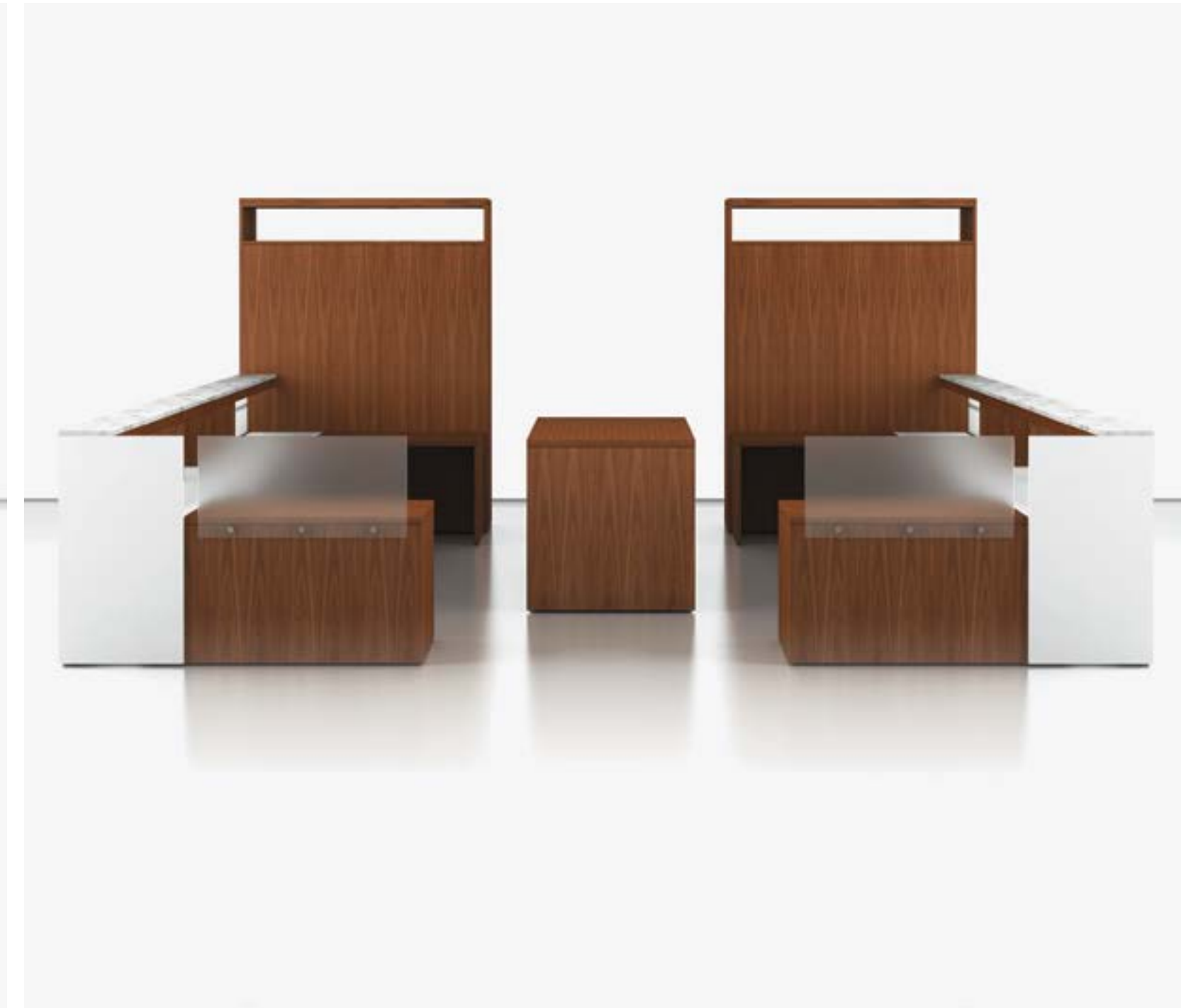
TABLET CASEGOODS | RECEPTION AND ADMINISTRATION

Custom millwork-quality workstations that welcome visitors, elevate corporate image and support administrative work functions