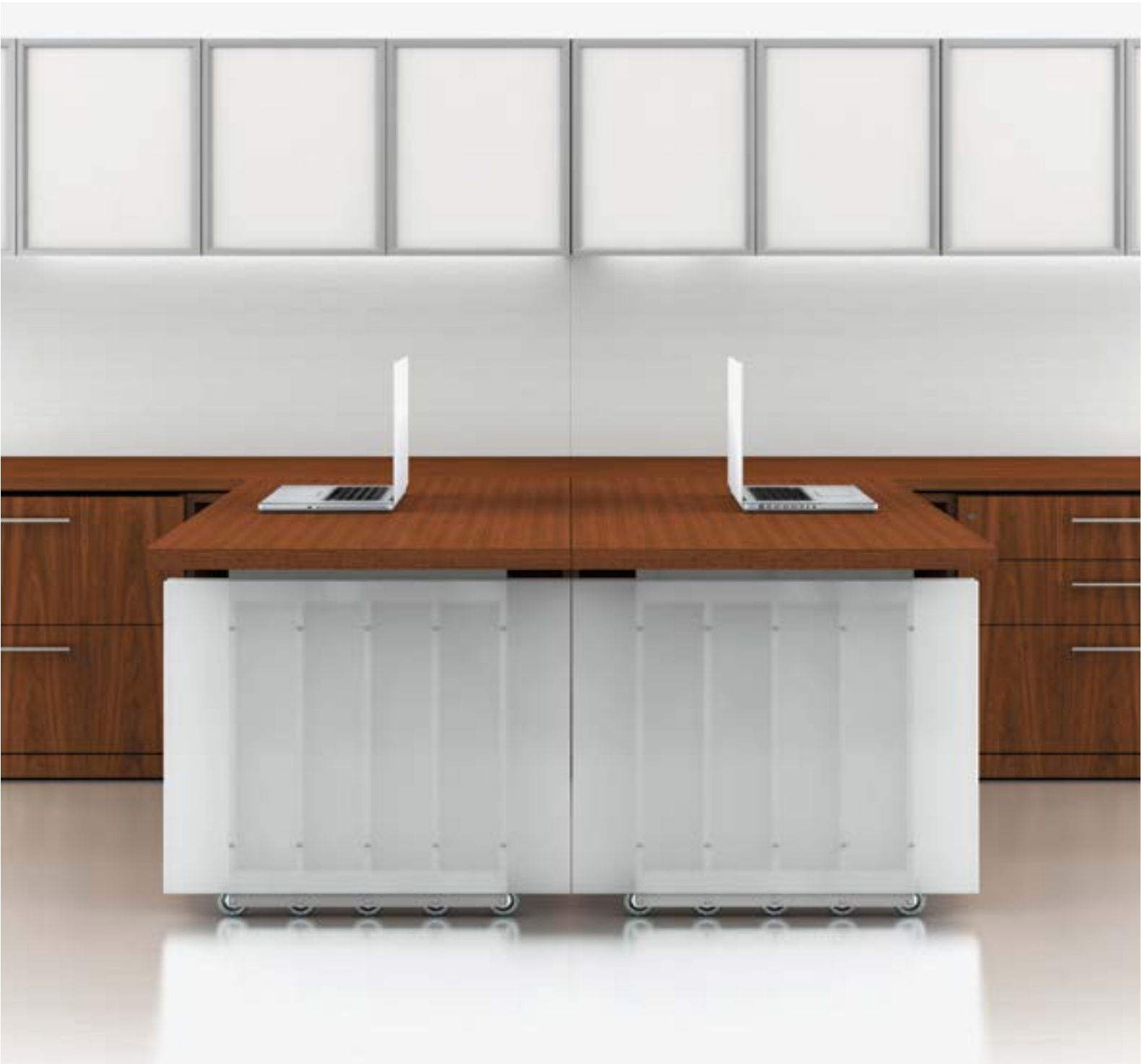
ABOVE AND OPPOSITE Mobile runoff end panels in acrylic Overhead doors in frosted glass Eames Aluminum Group Management Chair