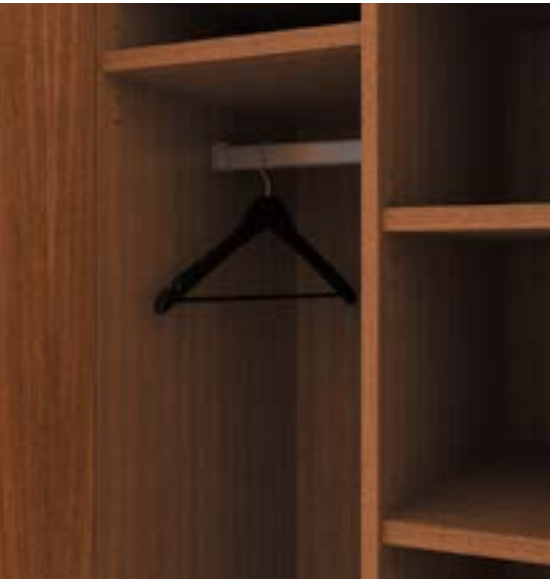
Wall mount shelves Electrical access panel Project shelves with acrylic diffusers and hanging organizer Wardrobe