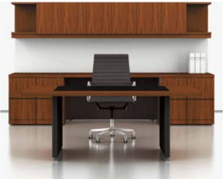
LEFT Eames Table with marble top Dual finish work wall RIGHT Custom open end overheads Slab desk with leather insert and belting leather end panels OPPOSITE Custom open end overheads Tablet MP Table Eames Aluminum Group Executive Chair