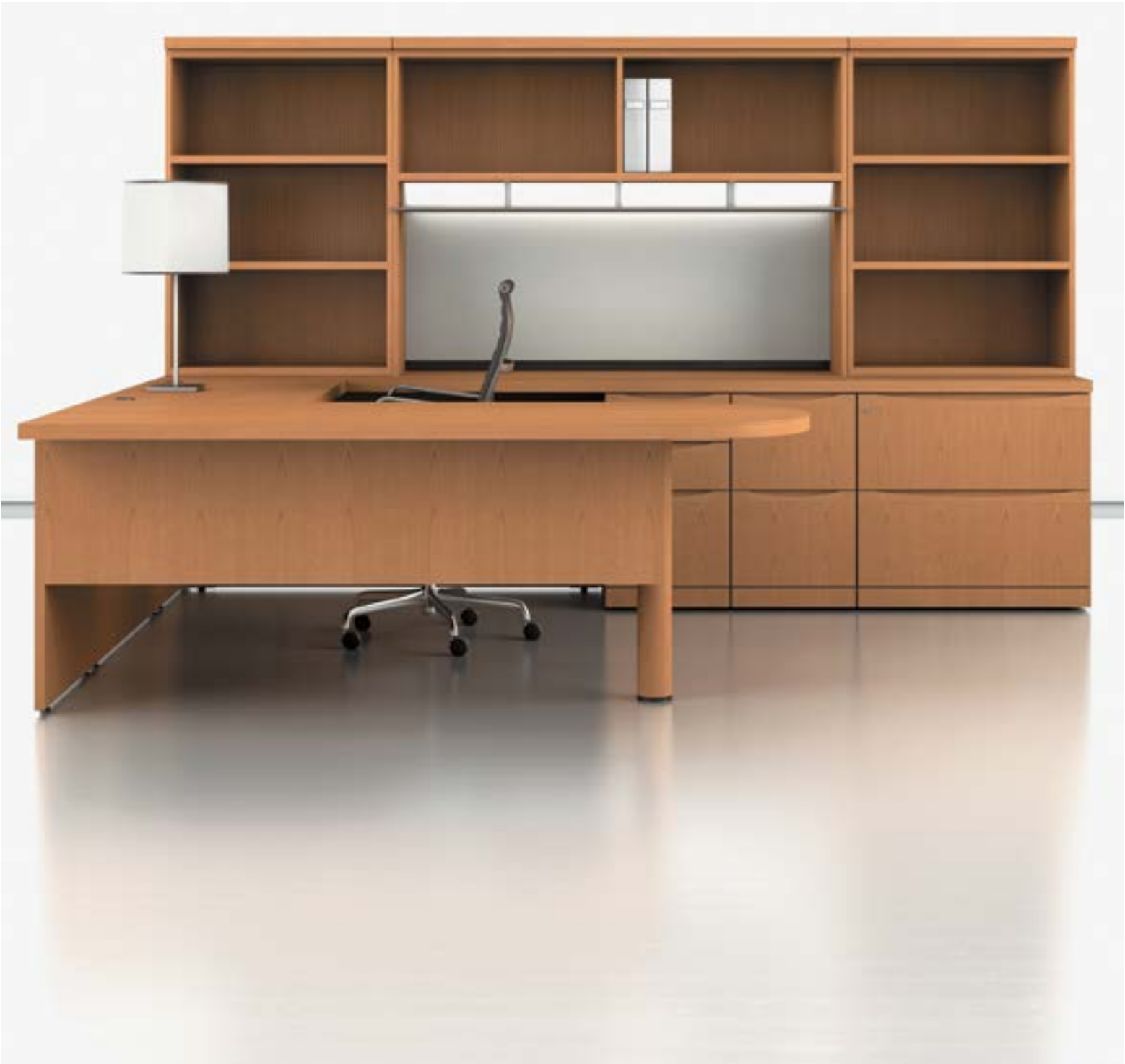
OPPOSITE Open overhead, bullet desk with wood column leg, half height wood modesty panel Eames Aluminum Group Executive Chair