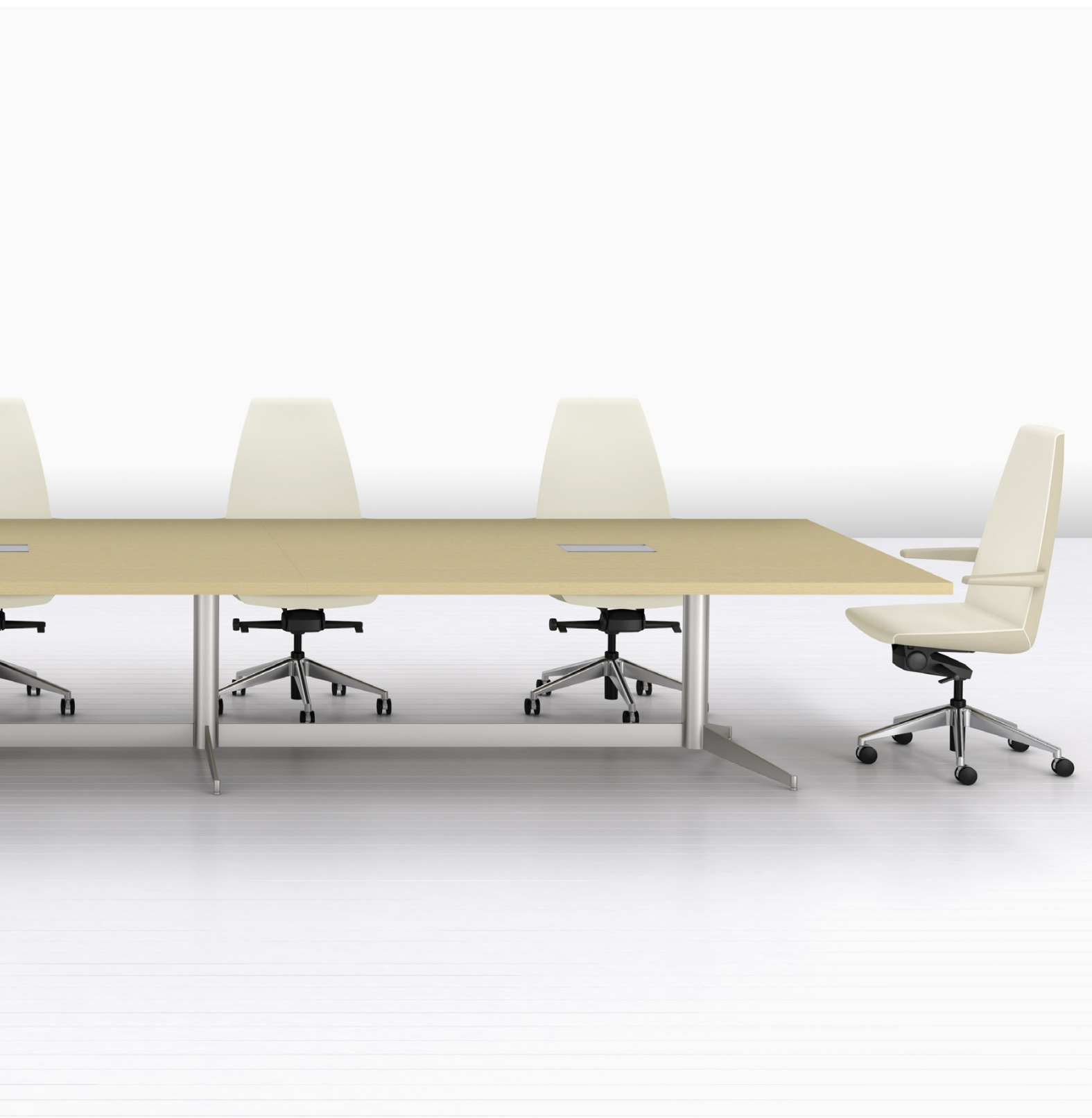
Rectangular conference table, 60" x 240" Rift Oak top, Satin Chrome base