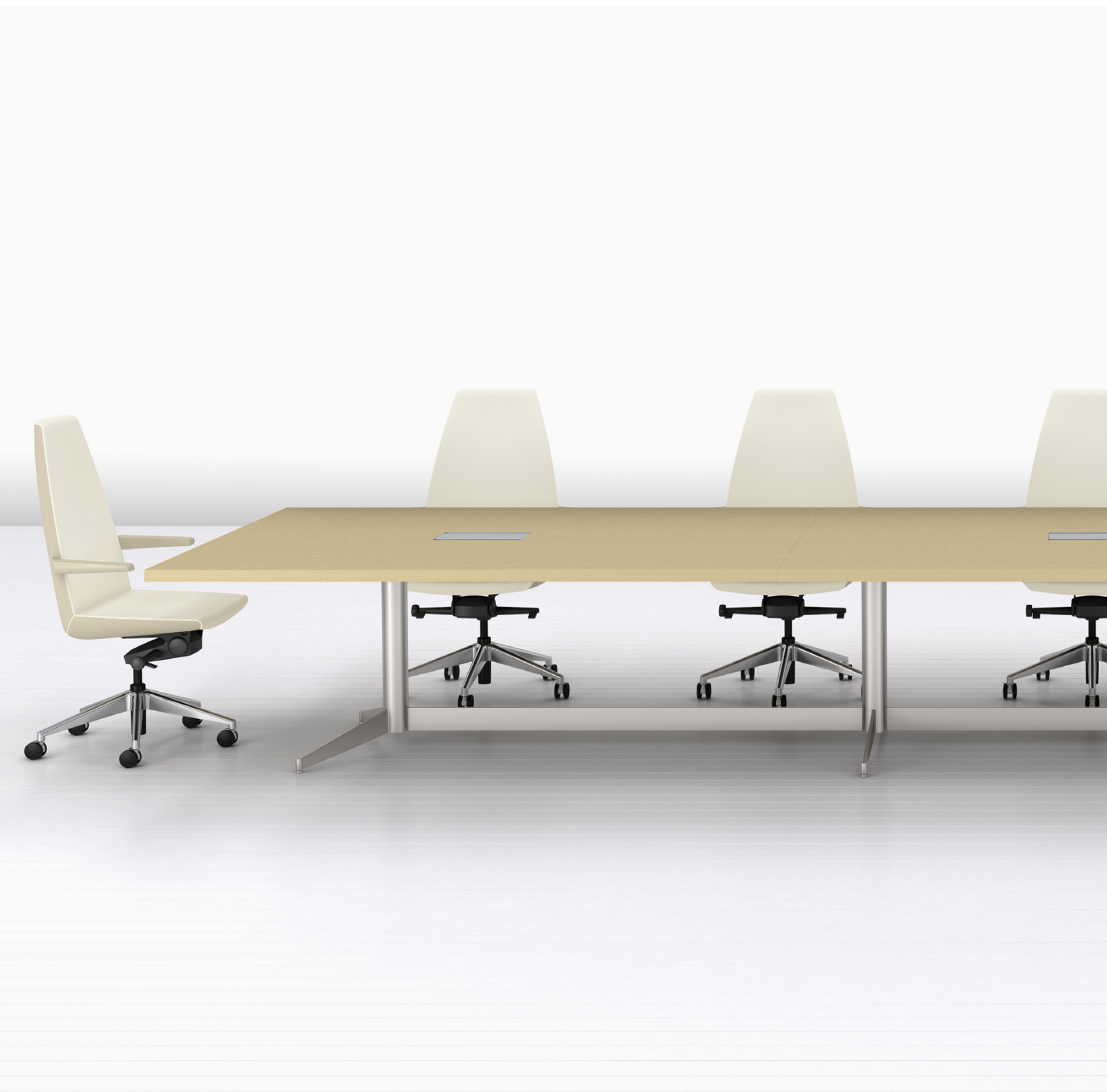
MP CONFERENCE TABLES