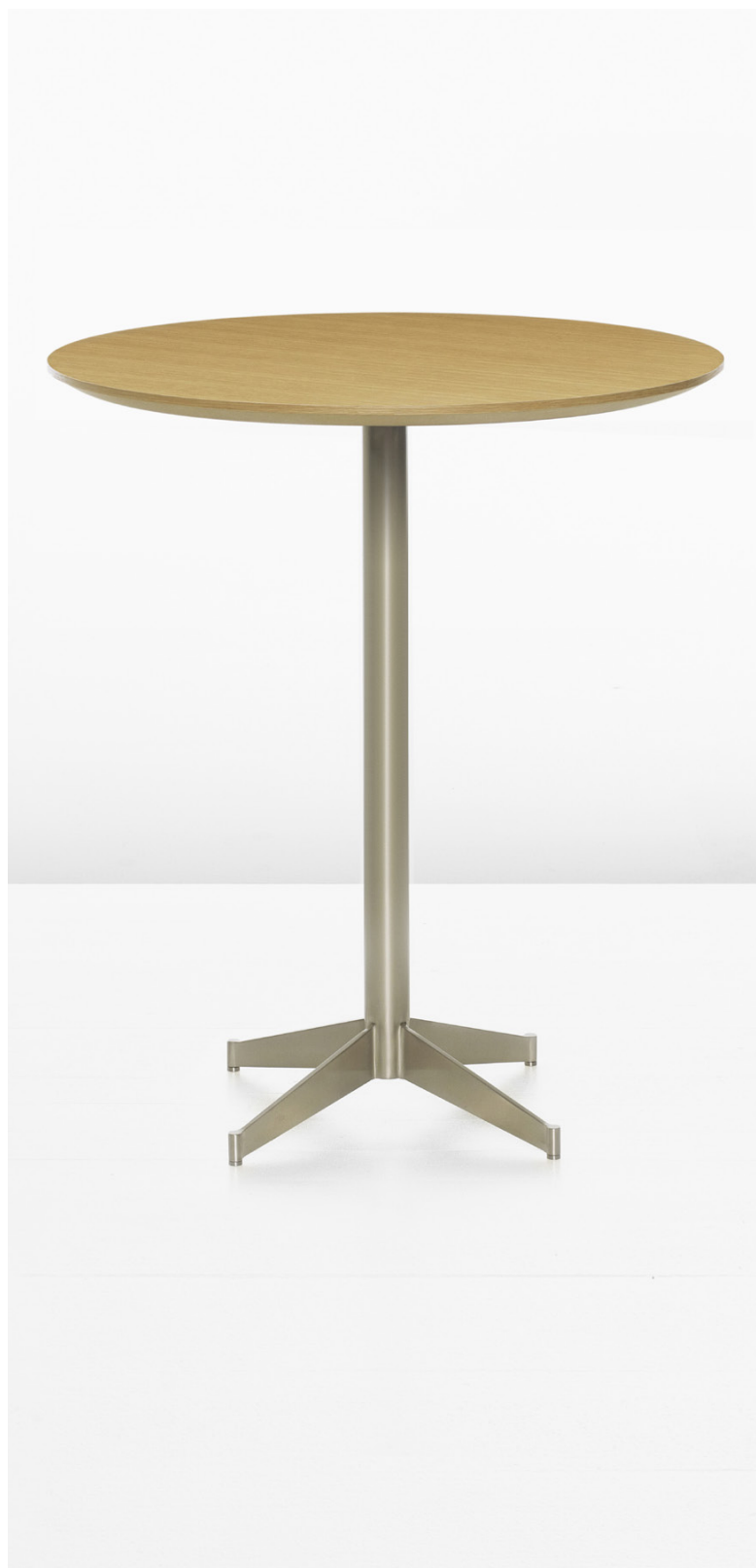
From left: 16.5" Occasional, 26" Lounge, 29" Desk, 42" Café