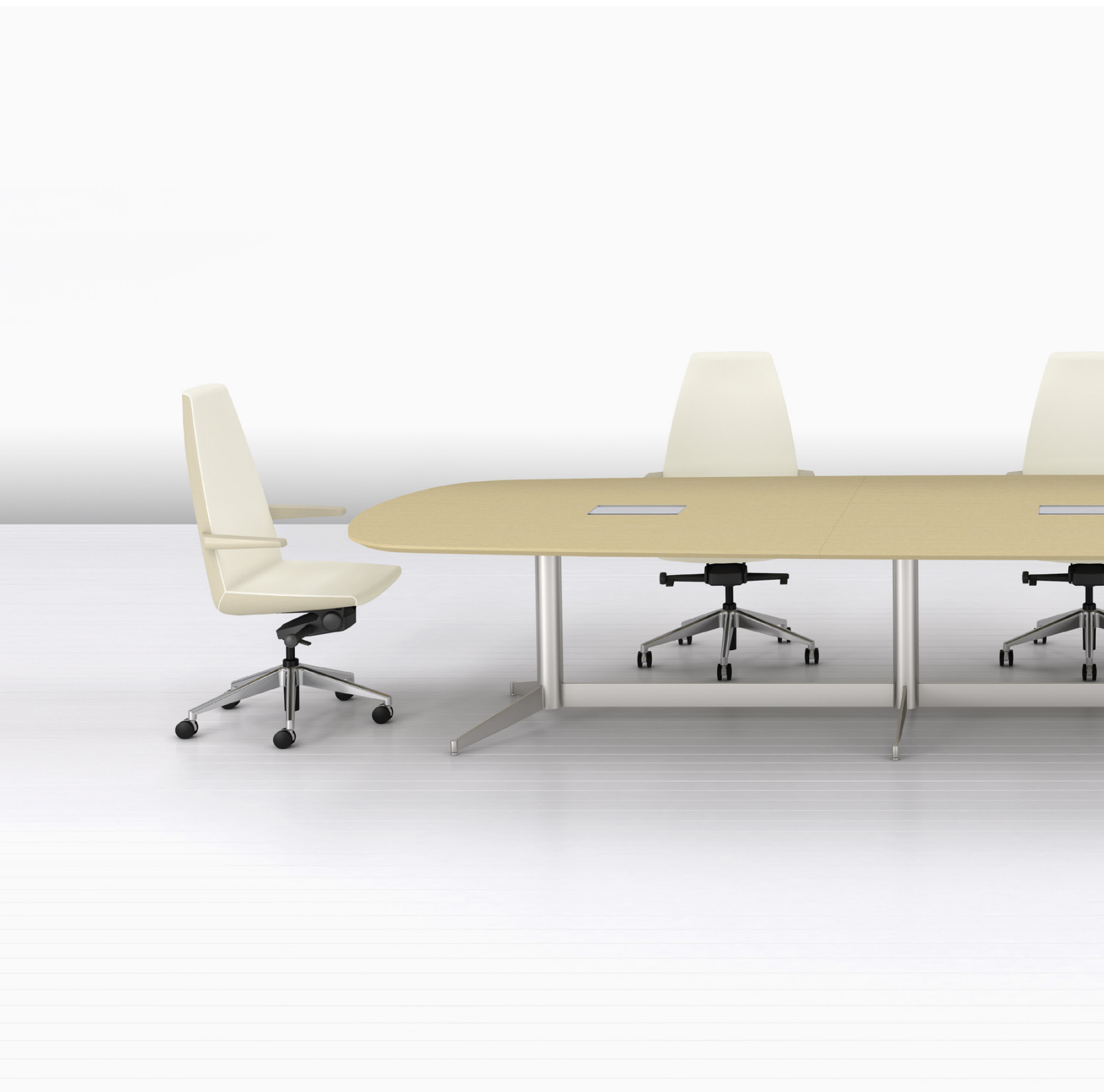
MP CONFERENCE TABLES