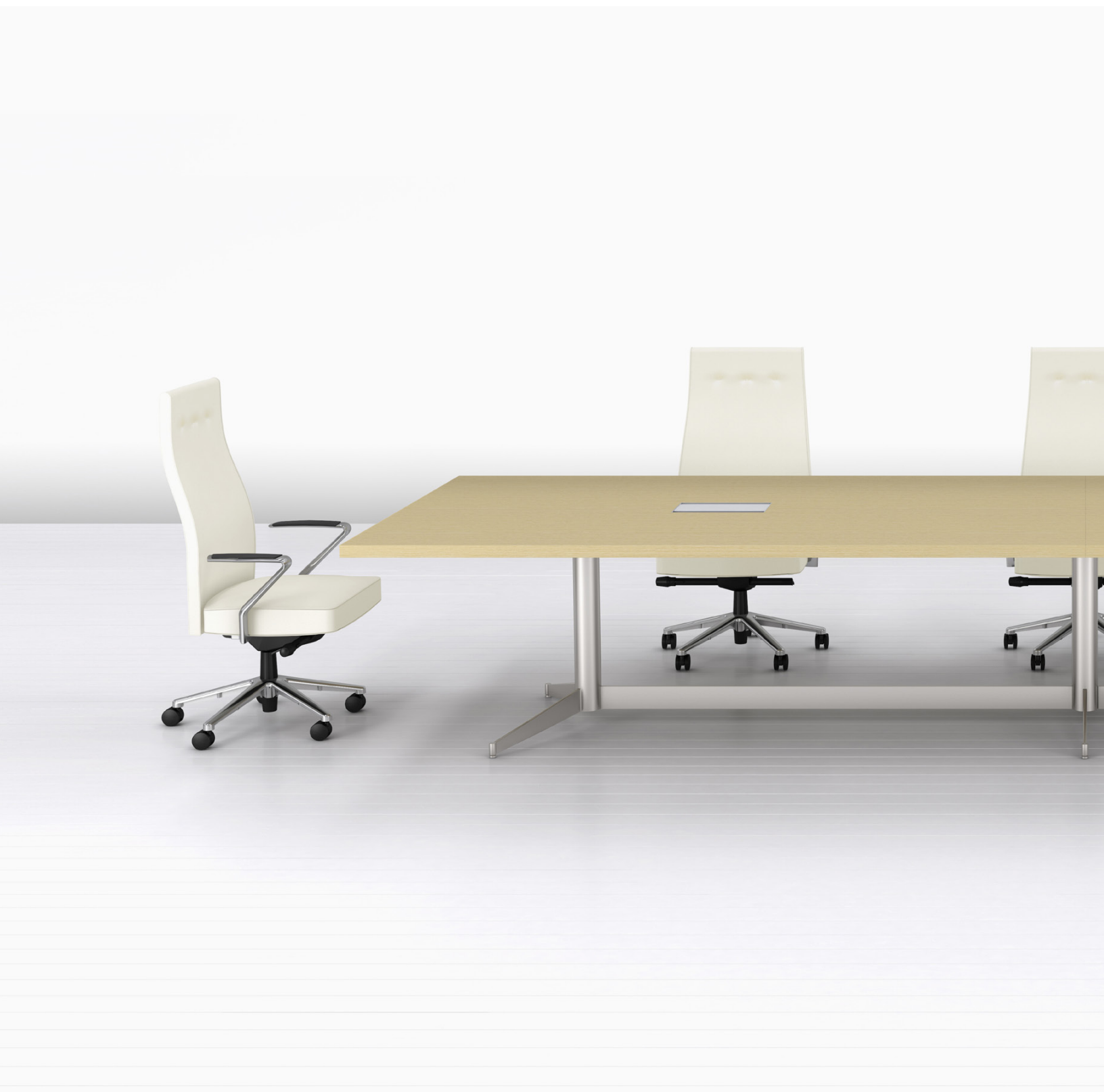
MP CONFERENCE TABLES