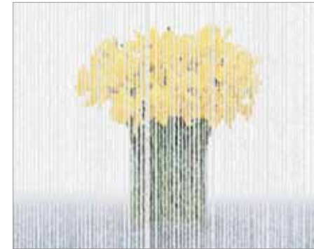
Light + Shadow®, Cascade™ A