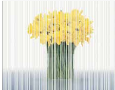
5+™ Collection, Avenue™ A

Twelve patterns from our premier lines available with quick lead times and affordable prices to enhance demountable walls. The collection includes our high-volume best sellers from designers such as Michael Graves and Suzanne Tick, and patterns such as Sateen and Vitracolor. Create privacy, beauty, and creativity in any demountable wall system with the craftsmanship of Skyline glass.