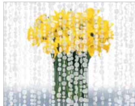
Light + Shadow®, Shimmer™ L