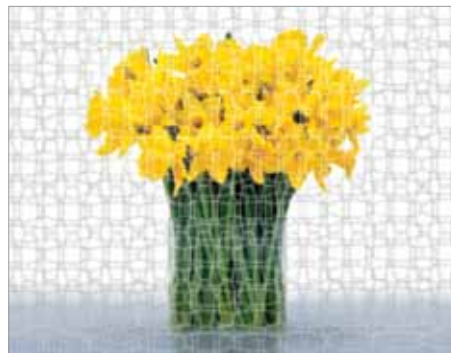
Collection in Whites™, Chainlink™ B