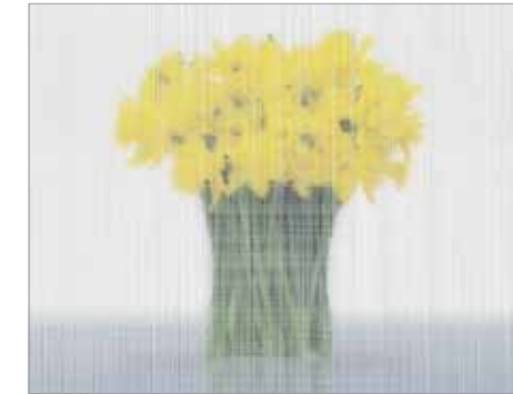
Weaves + Textures®, Batiste™ A

Shown: Row 1, Grade 1 Eco-etch, one side Also Vitracolor Markerglass