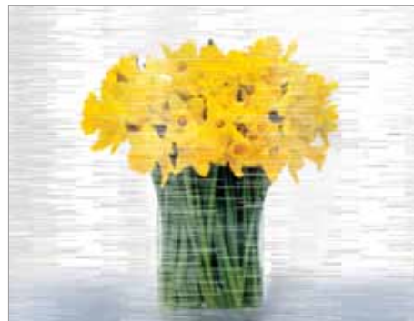
Collection in Whites™, Cantilever™ B

Shown: Row 1, Grade 1 Eco-etch, one side Also Vitracolor Markerglass