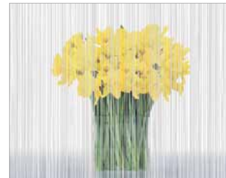
Weaves + Textures®, Sateen™ C