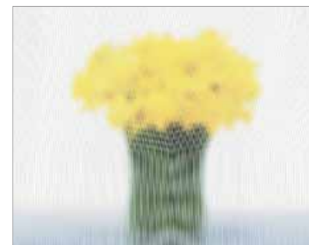
Collection in Whites™, Facets™ C

Row 2, Grade 2 Eco-etch, side one, side two Also Vitracolor Magnetic Markerglass