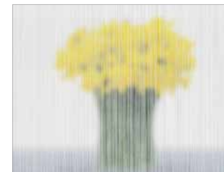
Weaves + Textures™, Sateen™ S

Row 3, Grade 3 Eco-etch, side one Texture, side two