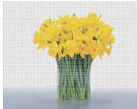
Collection in Whites™, Wireknit™ A