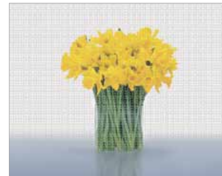
Collection in Whites™ Wireknit™ A