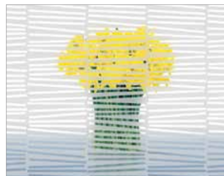
Geometrics™ Horizontal™ A