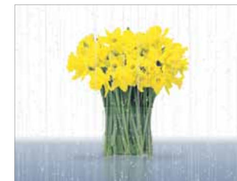
Weaves + Textures® Purl™ A