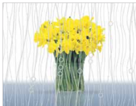
G Compendium™ Intaglio™ G

Note: Batiste A and Cascade A are unique to Skyline Select