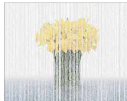
Light + Shadow® Cascade™ A