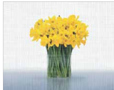
Collection in Whites™ Crosshatch™ A