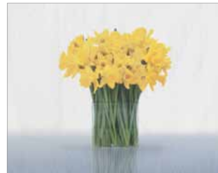
Collection in Whites™ Facets™ A