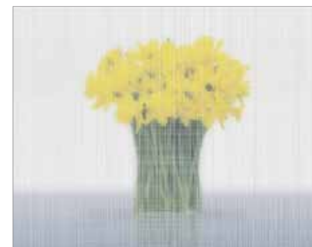
Weaves + Textures® Batiste™ A