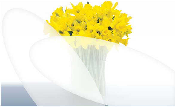
Technique Option D

Side 1: Large-scale eco-etch® pattern on clear field with Skyline Etch Sealer™