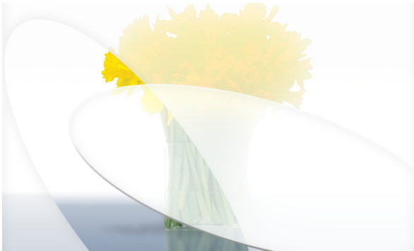
Technique Option F

Side 2: Large-scale eco-etch pattern on clear field with Skyline Etch Sealer