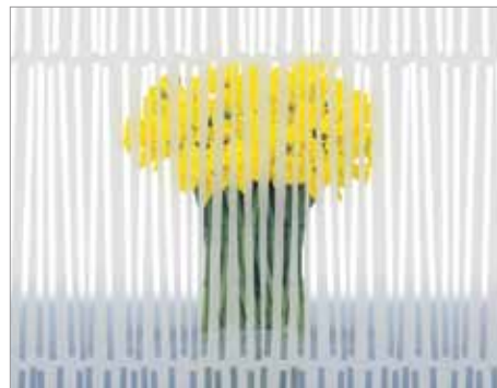
Bamboo™ A Sm

Designed in collaboration with Laurinda Spear of Arquitectonica. Combining Laurinda's distinctive contemporary approach—both playful and smart—the collection follows the bold, geometric aesthetics of the firm's architectural projects. Ten patterns for modern interior spaces offer fresh solutions that accommodate a wide range of design applications.