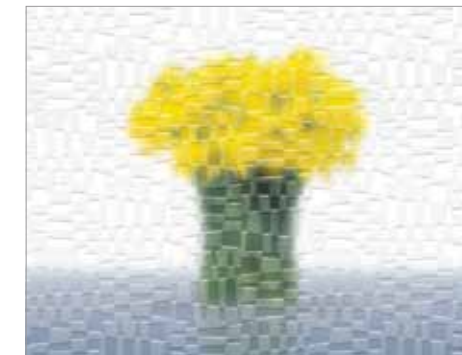
Starbox Repeat™ B Sm

Shown: Top Row: Small scale options A and B