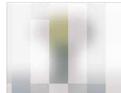
Times Square™ D Lg