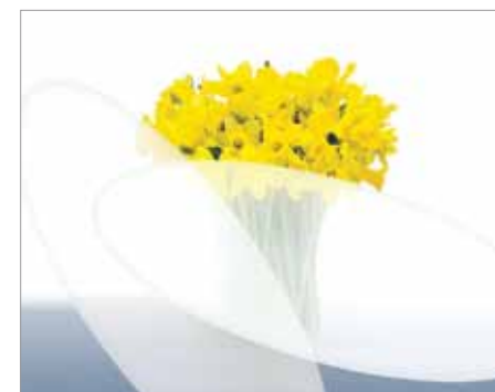
Random Ellipse™ D Lg