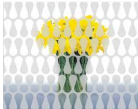
Insulation™ A Sm