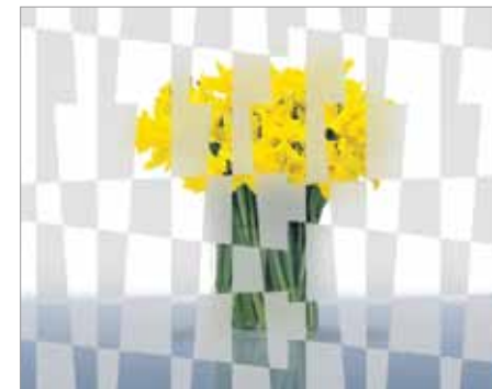
Starbox™ A Sm