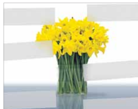
Horizontal™ E Lg