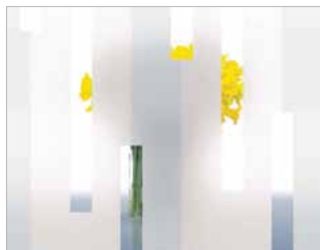
8th Avenue™ D Lg