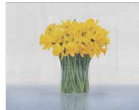
Kinetic Lines™ A