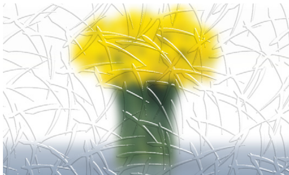
Technique Option AR108 T

Side 1: Small-scale textured pattern with clear finish