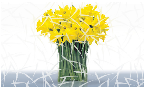
Technique Option AR108 A

Side 1: Eco-etch® pattern on clear field