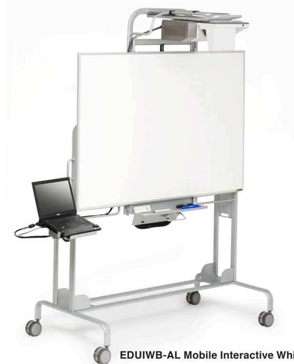
EDUIWB-AL Mobile Interactive Whiteboard