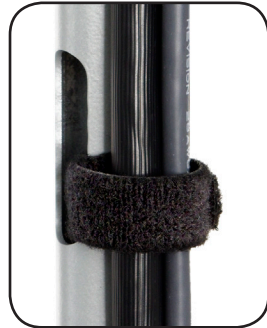
Integrated cord management