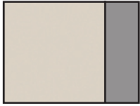
-ALGM Grey Mist top and Aluminum base

Work surface is available in Grey Mist laminate with matching Quartz trim or Natural Maple laminate with Aluminum trim. Powder paint steel bases are Aluminum and toe kicks are always Anthracite. Fluid Up power unit, when included, is always the stand alone DPAUSB9-P.