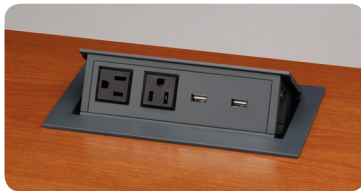
SCALE-UP tables are available with Fluid Up power.