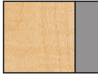
-ALMP Natural Maple top and Aluminum base