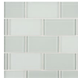
3"x6" field in mist matte & mist gloss