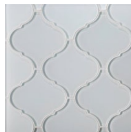
arabesque field in oxygen gloss