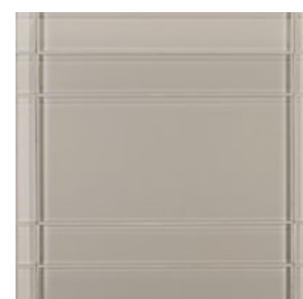
2"x12" & 6"x12" field in ecru gloss