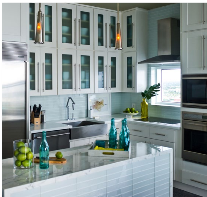
2"x12" field in oxygen gloss

Capturing light and reflecting it through delicate diffused color, Lucian brings an essential glass surface collection to the ANN SACKS assortment. A thoughtful palette and selection of formats can be used simply or layered together to create subtle texture and interest.