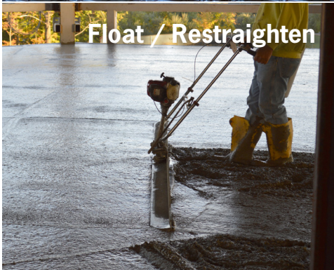
Float / Restrect