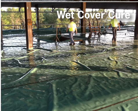
Wet Cover Cure