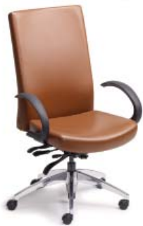
S5002 A : 20" C : 17 - 21" E : 25"