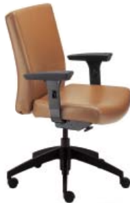
S5001 A : 20" C : 17 - 21" E : 20"