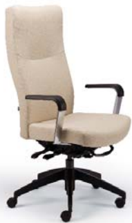
1402 A : 20" C : 17 - 21" E : 30"