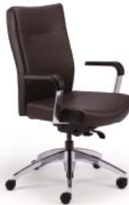
1401 A : 20" C : 17 - 21" E : 23 1/2"