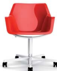
RE5-2 A : 20 1/2" C : 17" - 21" E : 17 1/2"