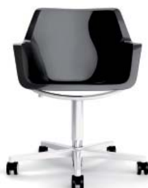
RE5-1 A : 20 1/2" C : 17" - 21" E : 17 1/2"