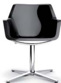
RE4-1 A : 20 1/2" C : 16" - 20" E : 17 1/2"