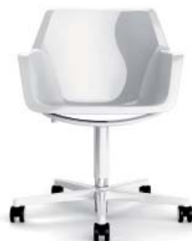
RE5-3 A : 20 1/2" C : 17" - 21" E : 17 1/2"