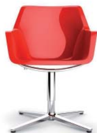
RE4-2 A : 20 1/2" C : 16" - 20" E : 17 1/2"