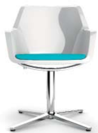
RE4-3 A : 20 1/2" C : 16" - 20" E : 17 1/2"