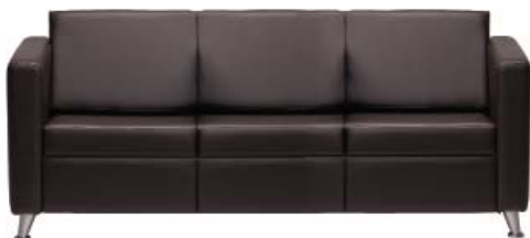
2003 A : 75" C : 18" E : 17"