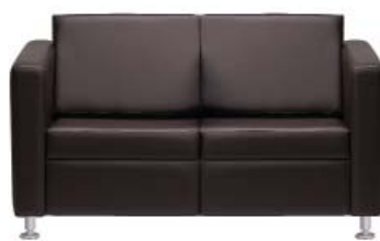
2002 A : 53" C : 18" E : 17"