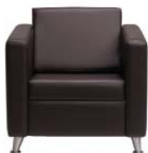
2001 A : 31" C : 18" E : 17"