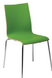
1742 A : 16" C : 17 1/2" E : 17 1/2"