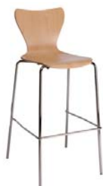
1783 A : 14 1/2" C : 29 1/2" E : 12"