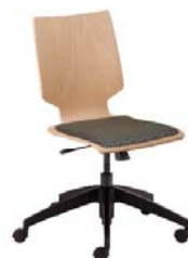
1761 A : 16" C : 15 - 20" E : 17 1/2"