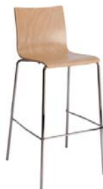
1782 A : 14 1/2" C : 29 1/2" E : 12"