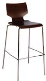
1781 A : 14 1/2" C : 29 1/2" E : 12"