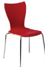
1743 A : 16" C : 17 1/2" E : 17 1/2"