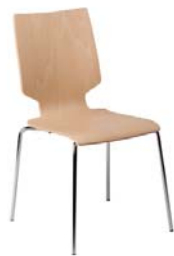
1741 A : 16" C : 17 1/2" E : 17 1/2"