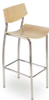
1680 A : 17" C : 30" E : 7 1/2"