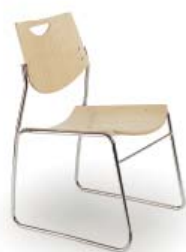
1640 A : 17 1/2" C : 18" E : 12 1/2"