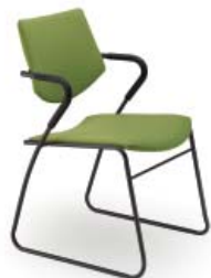
1642 A : 17 1/2" C : 18" E : 12 1/2"