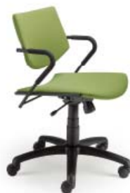
1662 A : 19 1/2" C : 16 - 21" E : 13"