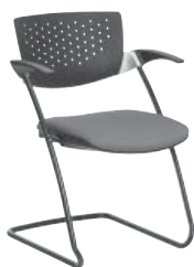
172 A : 18" C : 17 1/2" E : 11"