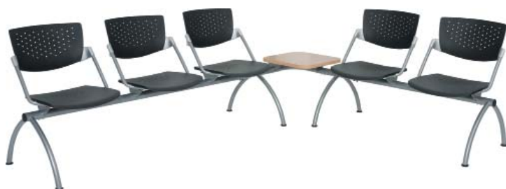
176 A : 18" C : 18" E : 11"