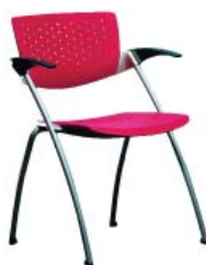
170 A : 18" C : 17 1/2" E : 11"